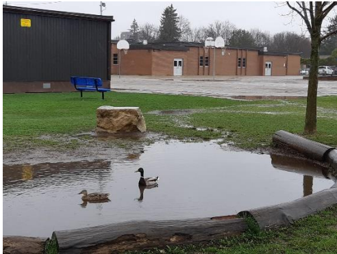
Forget May flowers- April showers bring ducks!